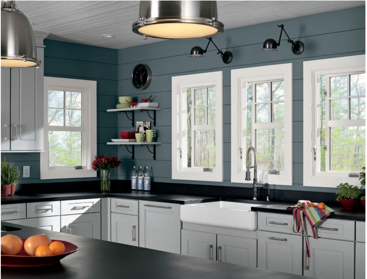
The bars on these windows emulate the look of traditional double-hung sashes that slide up and down, but each window has only one sash, which swings open like a door. Shown: Marvin Ultimate Casements; marvin.com