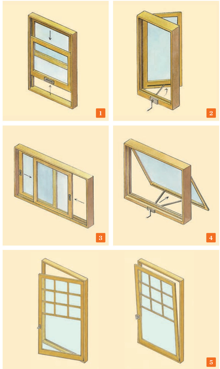
ILLUSTRATIONS: RODICA PRATO

There's no sash to open, so it lets in only light, not air. That makes it less expensive and more energy efficient than comparable windows with sashes. Best for inaccessible areas, such as gable peaks, or as architectural accents because it can be crafted in so many sizes and shapes.